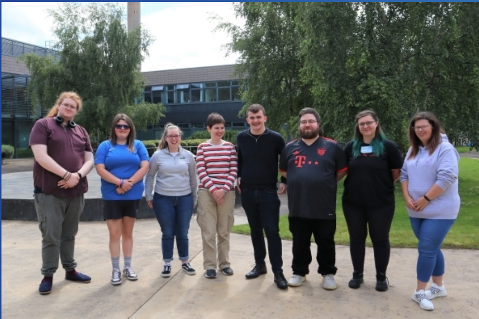
Highlands and Islands Students' Association

Students at each academic partner can elect Local Officers to represent students where they study.