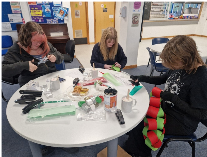
Fig. 3 Winter Wellbeing Sessions

Over 40 students at Lerwick campus, and 20 students at Scalloway campus, were treated to luxury hot chocolate and pastries and the opportunity to sit and chat with fellow students, HISA local teams, and UHI Shetland student support team while making some Christmas crafts to decorate the local campuses. These were excellent examples of partnership working between HISA and the student support team with students engaging well with the activities.