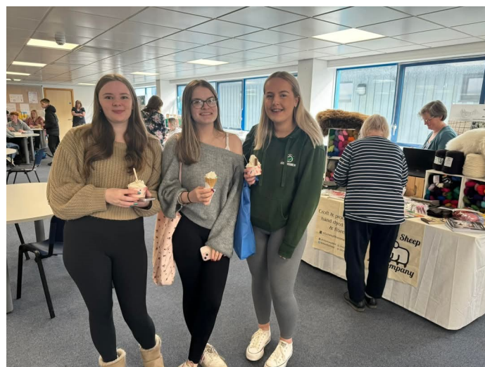
Fig. 2 Freshers Fair

Freshers' events were focussed on mainly campus-based activities. A local business fair welcomed students to the hustle and bustle of busy campus life at Lerwick, with Scalloway and Mareel based students permitted and supported to travel to Lerwick campus to participate. A variety of local businesses and organisations, from RNLI and NHS to a local art supplies store and Boots, came laden with freebies and student discount rates to showcase the local benefits available through their businesses. Around 80 to 100 students came through the fair over the course of the day, and the inclusion of a burger van and Mr Stripey the local ice cream van proved a hit with staff and students alike.